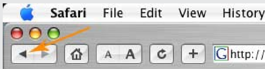
This is the intuitive way of going back on the website

Having a back button on menu will only confuse the visitor with pages and functions. The simpler and easier to understand the better, most of the times it doesn't need the back button, on your browser you will see a back button, it will be enough intuitive for the visitor use it. But of course that it may be helpful in some cases to have a back button, in order to avoid user to get lost when there's a lot of information.